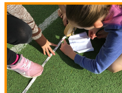
Paper Planes We made use of our paper plane craze in maths by measuring the distances and working out the average distance per plane