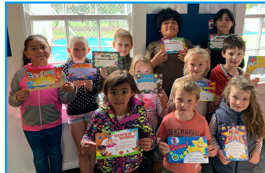
Certificates for last week of Term 2