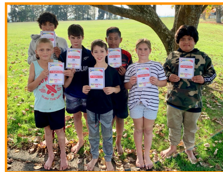
Rugby Players from the Rugby/Netball Fun Day