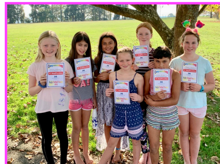
Netball Players from the Rugby/Netball Fun Day